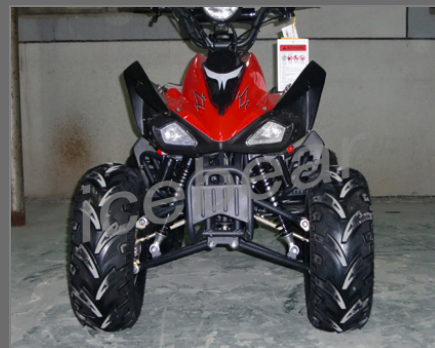
RED AND BLACK