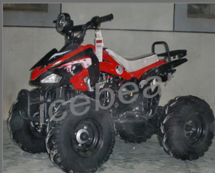
RED AND BLACK