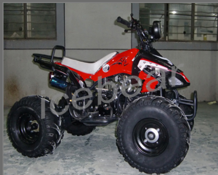
RED AND BLACK