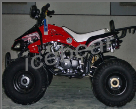
RED AND BLACK