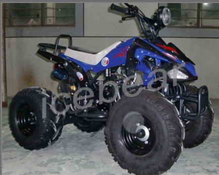
BLUE AND BLACK